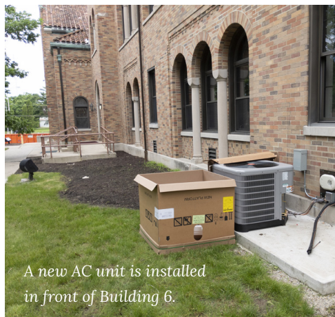
A new AC unit is installed in front of Building 6.

Watch for future opportunities to get your hands dirty tearing up that dance floor when the time comes. ■