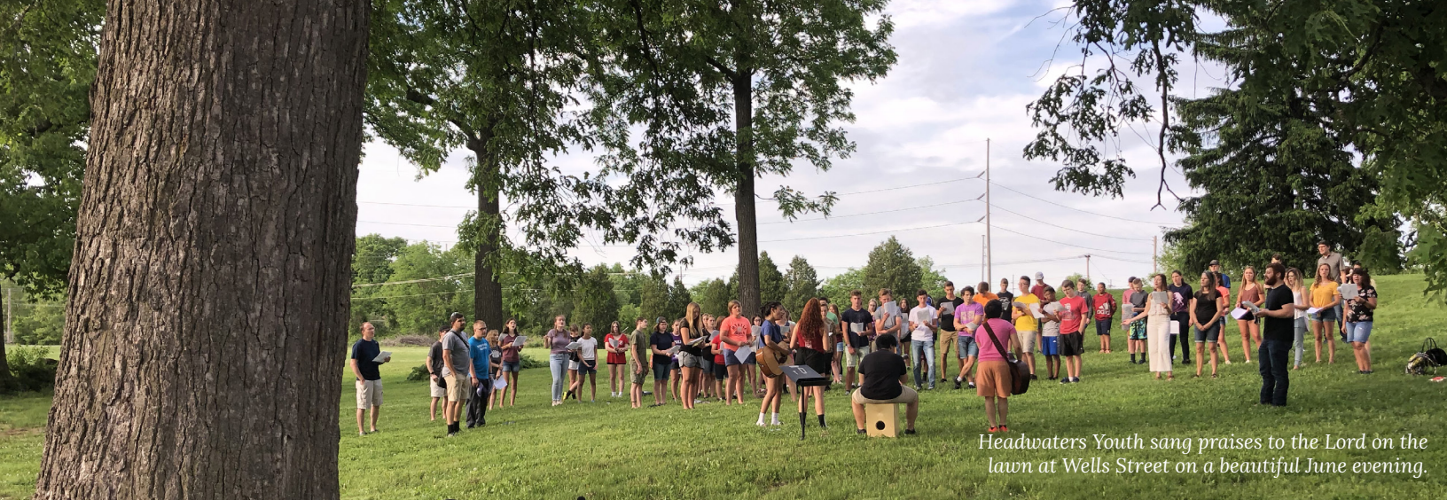
Headwaters Youth sang praises to the Lord on the lawn at Wells Street on a beautiful June evening.